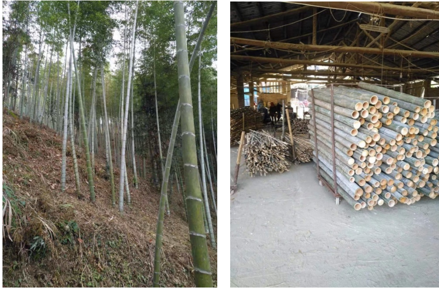
Figure 2 Bamboo culms and rough processing site near plantations

dasso Traditional Bamboo is made from bamboo strips that are cut from the bamboo stems. The production procedure is quite traditional and classical. It combines bamboo strips with glue to realize horizontal and vertical structure which shows rather rustic structure of bamboo material. These traditional bamboo panels can be used for various interior applications.