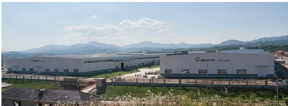
Figure 1 dasso factory in Jiangxi, China

dasso has now 8 manufacturing facilities and over 1000 employees, in addition to owning over 2,700 hectares of productive, sustainable bamboo forest in China. Besides, dasso has also established an independent R&D team with 50 people for product optimization and innovation. Up until now, 65 authorized patents, 24 innovative patents and 13 international patents have been acquired by dasso.